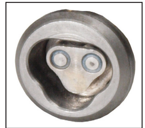
Figure 1 - Dirty Lock Face