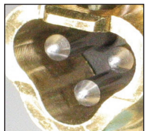
Figure 4 - Clean pins