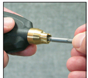
Figure 3 - Place retracted BRUSH on pins and twist